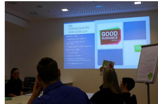
Focus group with practitioners in Berlin

The Ballymun Job Centre in collaboration with Rinova designed and developed an e-learning Moodle platform with the aim of testing the existing six Case Studies, Teaching Notes, Methodological Guides and Recommendation Handbooks on new learners. Additional learning objectives of the curriculum involved the introduction of Case Study writing as well as the concept of a Community of Practice. The Moodle platform, which was informed by the results from Guide 2.0 Methodological Concept, was launched beginning of July and was tested by the partners across 6 EU countries. The goal was to have a minimum of 10 participants/learners from each country test the materials.