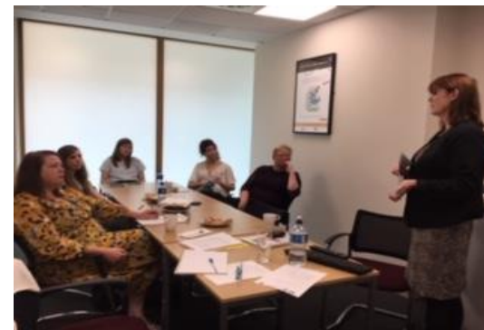
Introduction of e-learning platform in Dublin

“Additional learning objectives of the curriculum involved the introduction of Case Study writing as well as the concept of a Community of Practice.”